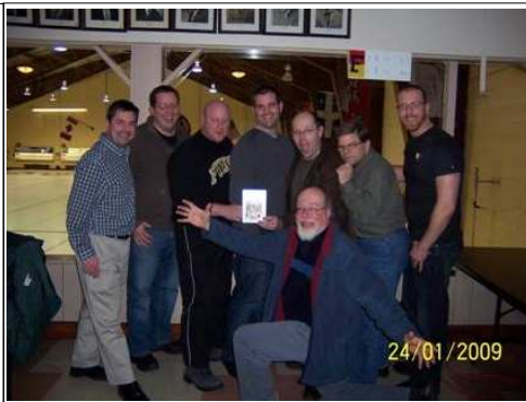
First Place Crazy Eight's, 74 points