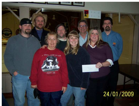
Third Place Border Brigade, 72 points

(Can you spot any NFCC curlers in any of the pictures above? I see at least 5)